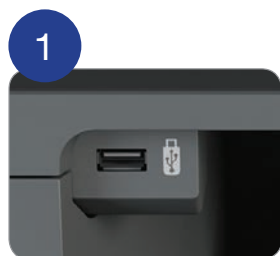
USB direct print*