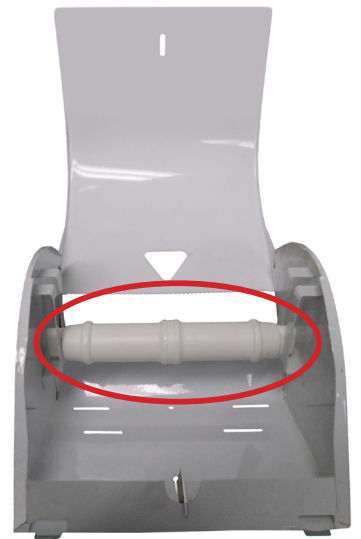
FIGURE 2: Old 4941 Dispenser (inside view)