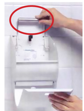
FIGURE 6: Old 4941 metal bar Dispenser NO ACTION REQUIRED