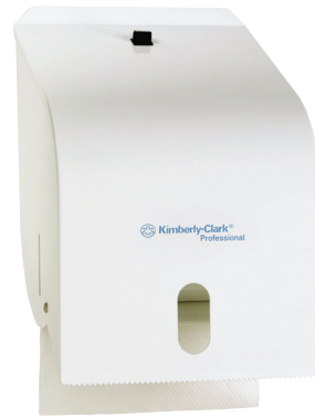
FIGURE 1: Old 4941 Roll Towel Dispenser

All 4941 dispensers with the new kite logo on the front (figure 5), or with metal bar mechanism inside (figure 6) require no further action.