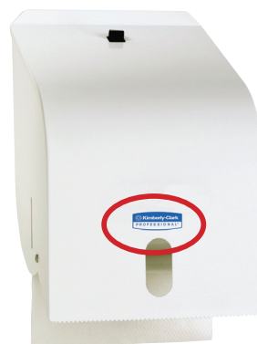
FIGURE 5: New 4941 Roll Towel Dispenser NO ACTION REQUIRED