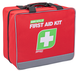
Portable grab and run soft pack case design with water resistant fabric backing