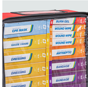
Colour coded contents to make locating the correct item fast and easy