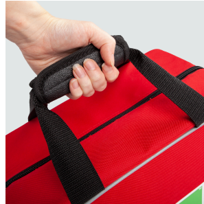
Portable grab and run soft pack case design with water resistant fabric backing